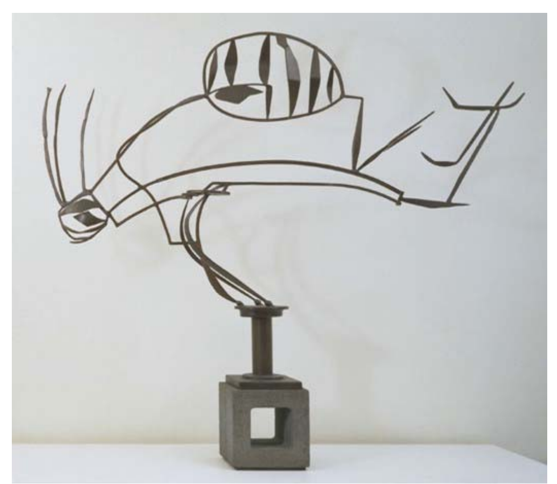
David Smith, Australia , 6 feet 10 inches high, rusted steel "At Present sculpture is on the point of turning tables on painting with respect to fertility of ideas and range of possible subject matter."

At present sculpture is on the point of turning the tables on painting with respect to fertility of ideas and range of possible subject matter. But the new sculptor still remains a little too timid in the face of the other art, too passive, and still too ready to accept any and all of its suggestions. This is excusable when we remember for how long a time and until how recently, painting did lead the way, and how much more interest and excitement could be found in almost any painting than in almost any piece of sculpture contemporaneous with it. But it is time we became conscious of the changed relation between the two arts, and that the new sculptor himself acquired more confidence in the independent power of his medium.